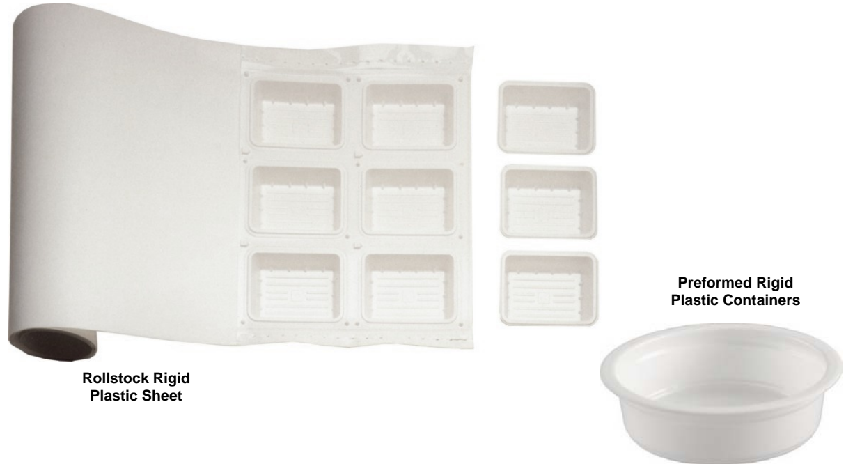
Rollstock Rigid Plastic Sheet